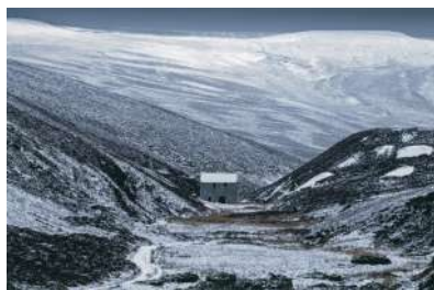
C71 KATRINA BRAYSHAW – Isolation