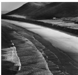
C10 TONY MARLOW LRPS – Rising Sun over Rhossili Bay