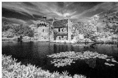
Scotney Castle C71