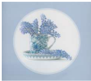
C4.26 YVONNE SHILLINGTON - Grape Hyacinths