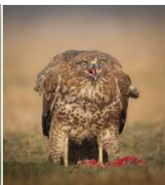
C46 CZECH CONROY CPAGB - Common Buz- zard Eating