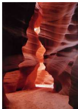
Entrance to Antelope Canyon