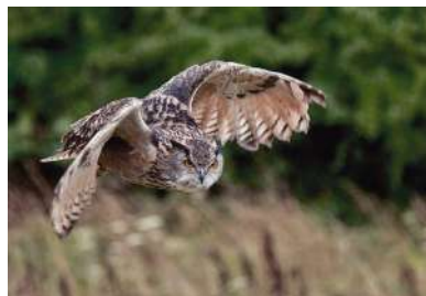
C30 ARNOLD PHIPPS-JONES - Eagle Owl in Flight