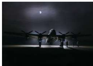
C4.26 PHILIP ANTROBUS FRPS - Moonlit Return