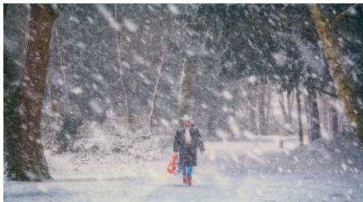
C4.26 GAYLE KIRTON - Snowfall