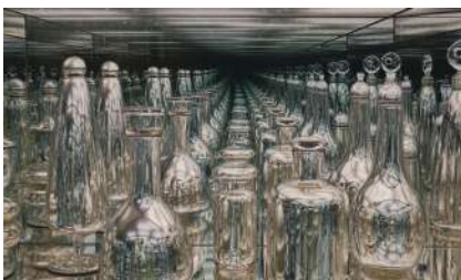
C73 PETER MACLEOD – Mirror Mirror