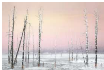
C61 PAM SHERREN - Skeletal Trees, Yellowstone