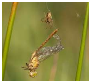
Common Darter Prey of Larinoides sp.