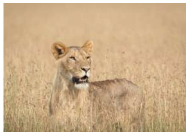
C46 CZECH CONROY CPAGB - Young Male Lion Searching

2019 Annual Competition—Highly Commended