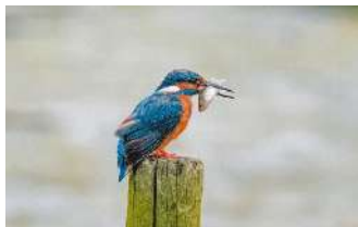
Kingfisher with Catch C71