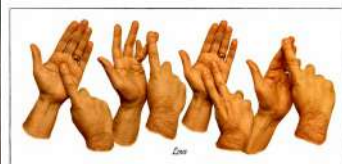
C62 ANDY WOODERSON - Love