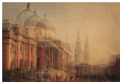
C72 JOHN WIGLEY LRPS - Gallery Impression