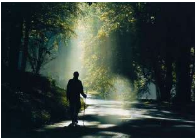
Walking through the Glen

He also contributed greatly to UPP, which he joined in April 1969. One of the un-sung heroes of the Club, he became Circle Secretary of the newly-merged Circle 2/25 in 1993. He was a regular attendee of the annual Conventions, although he sadly missed the 2019 meeting when he was given a certificate recognising 50 years membership. He will be greatly missed by all who knew him.