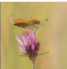
C45 BOB CRICK - Small Skipper