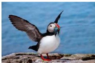
Bring Home the Dinner C19