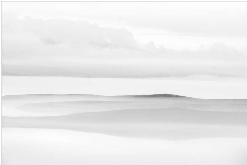
Island in the Mist, Iceland.