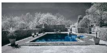
The Blue Pool C36