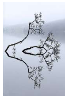
C61 COLIN DOUGLAS ARPS DPAGB AFIAP BPE4 - Esthwaite Reflection