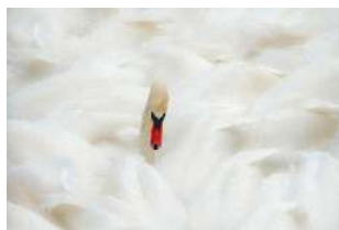
Swan Lake C19