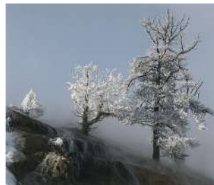
C74 SHIRLEY DAVIS CPAGB - Frozen Trees in Steam