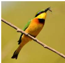
IAN WHISTON ABPE DPAGB EFI- AP/b. - Little Bee Eater with Ant