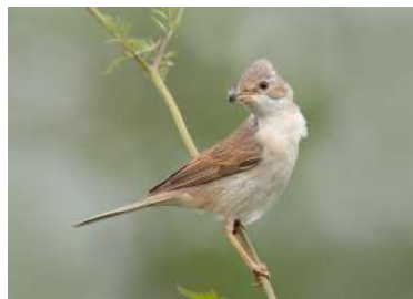
C31.32 NEIL HUMPHRIES – Whitethroat