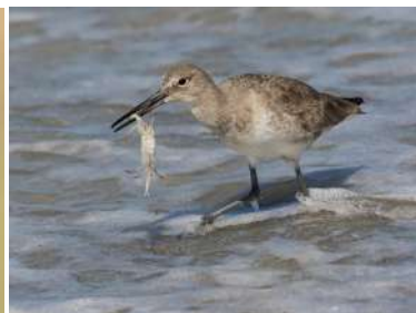
C45 BOB CRICK - Willet with Crab