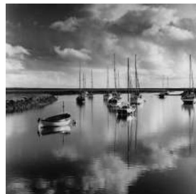
C10 TONY MARLOW LRPS – Sun Rise at Wells