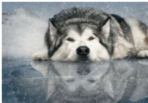
C72 JANE LINES MPAGB LRPS - Malamute on Ice