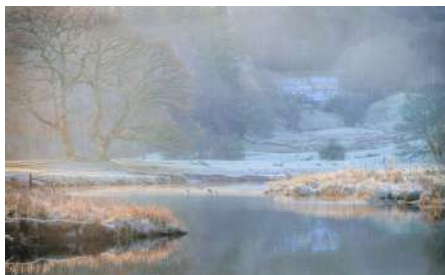
C4.26 BARON WOODS FRPS - Winter Frost