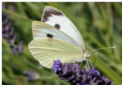
C62 LES HARRIS - Summer Visitor