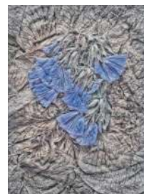
C11 COLIN SOUTHGATE FRPS DPAGB - Untitled