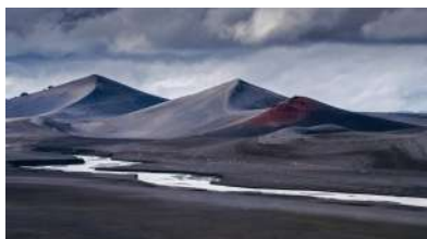
C71 KATRINA BRAYSHAW – A Touch of Red