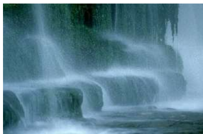
Water Step C36