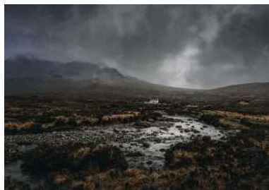
C29 ROY ESSERY MPAGB – Honeymoon Cottage