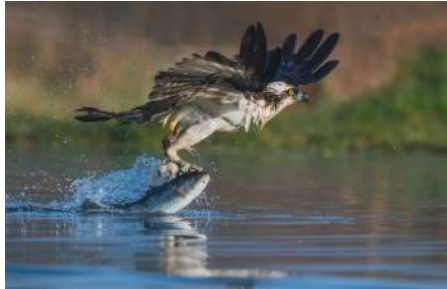
C4.26 MILES LANGTHORNE DPAGB - Osprey and Catch