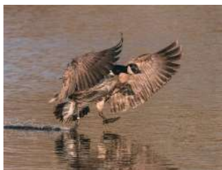
Goose-Stepping Goose C36