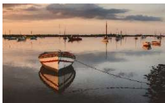
Last Light at Branchester C36