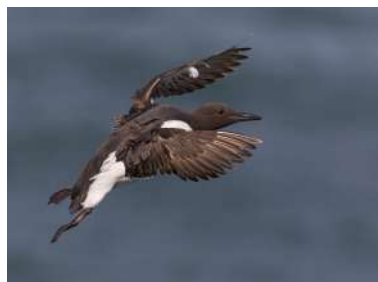
C45 BOB CRICK - Common Guillemot in Flight