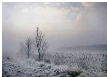
C29 COLIN WESTGATE FRPS MFIAP MPAGB - Frosty Morning, Mersea Island