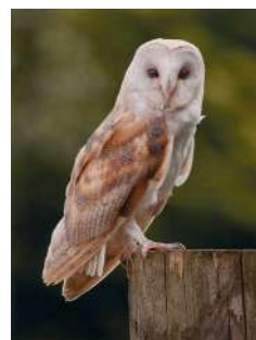
C30 TED STURGEON LRPS - Barn Owl Great Wood, Battle