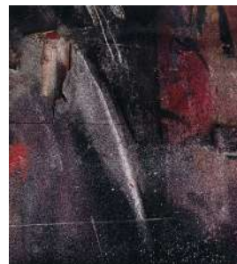
C29 BARBARA BEAU- CHAMP - Off the Wall