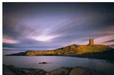
C71 IAN GOSTELOW DPAGB ARPS BPE3 – Last Night, Dunstanburgh