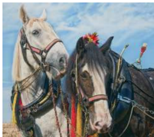
C4.26 GAYLE KIRTON - Shire