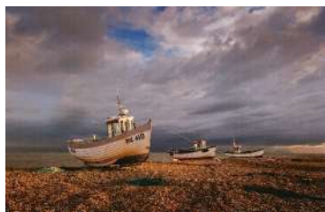
The Three Sisters C71